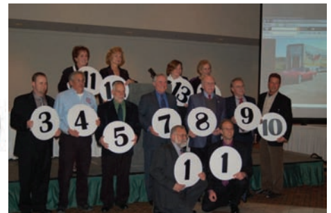
From last year's award banquet