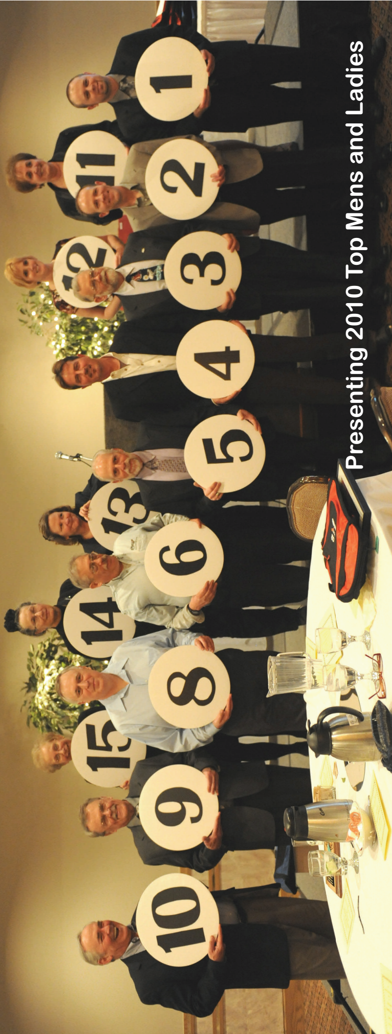
Presenting 2010 Top Mens and Ladies