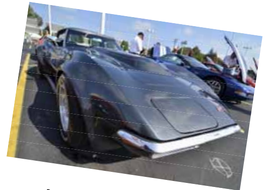
At the Motor City Corvette Concourse