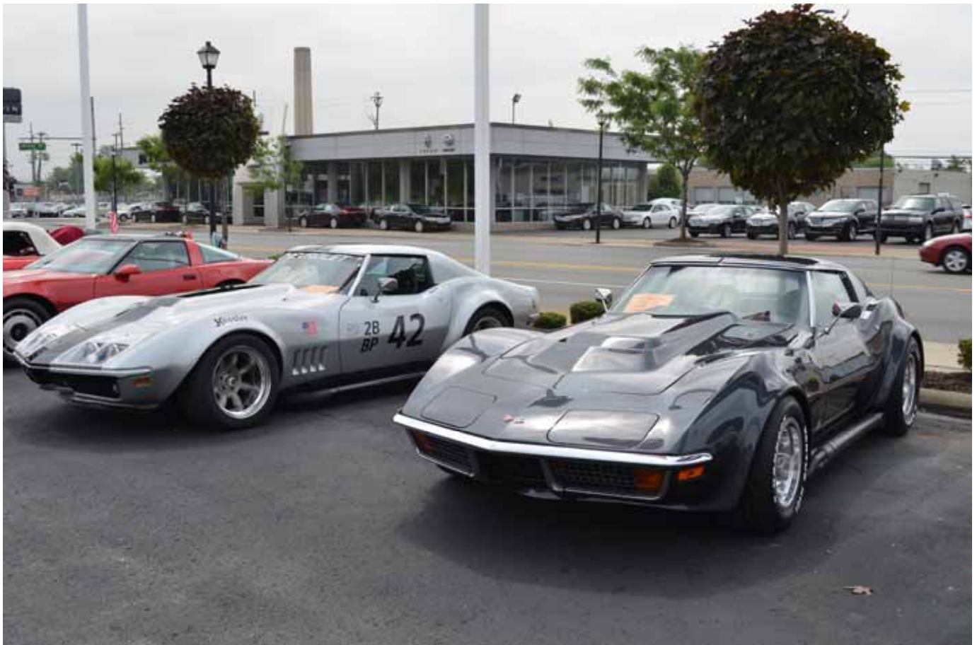
At the 2011 Encounter Father & Son Vettes